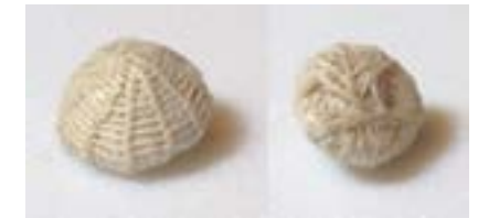
Dorset Knob buttons