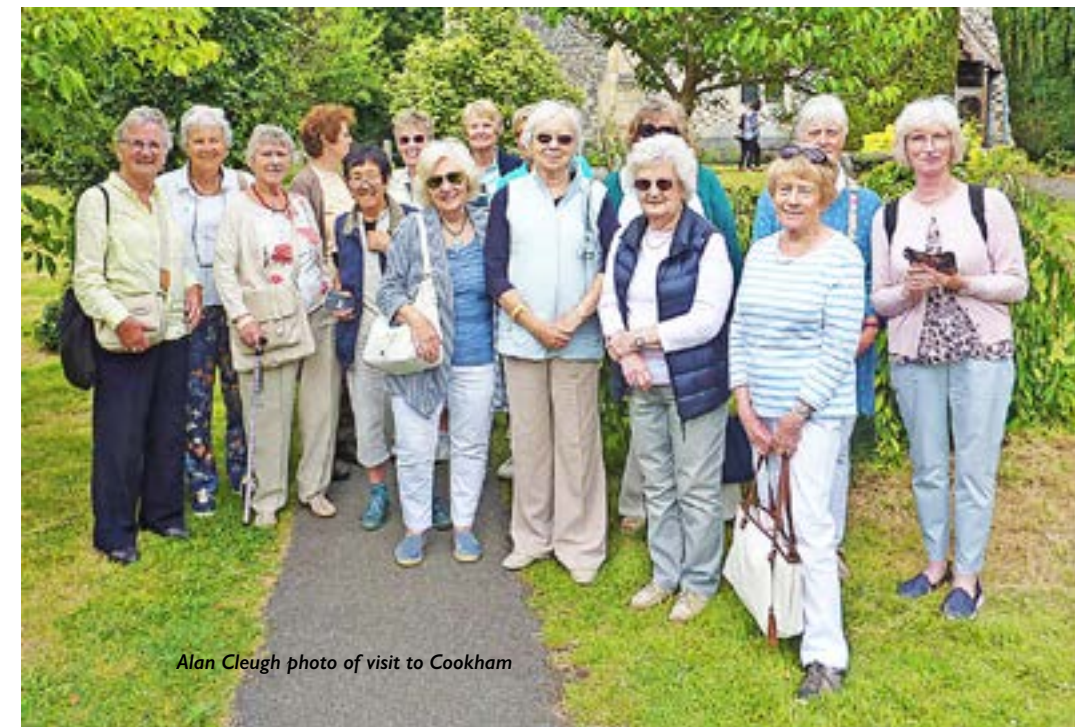
Alan Cleugh photo of visit to Cookham

Cover photo fallen leaves in Leatherhead car park by Maurice Baker