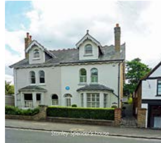
Stanley Spencer's house

The vast painting called "Christ Preaching at Cookham Regatta" on the longest gallery wall was incomplete at the end of Spencer's life. This work provoked much interest and