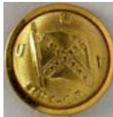
metal button made in Birmingham for the Confederacy in the American Civil War

(from a talk given to the Social History Group)