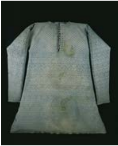
1 of 3 waistcoats worn by Charles I to his execution word.

The doublet was fastened by a single central row of small, closely spaced buttons. These were made tall, to avoid the small buttons slipping out of the stiff fabric. As the button line of fashion moved outwards and the garment became more flexible, a wider and lower button was needed. Dome shaped buttons named Dorset Knobs were developed.