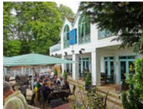
Ferry Inn for lunch

Spencer painted commissioned portraits, family and friends and local scenes, many with a spiritual meaning. Biblical scenes and especially the Resurrection often feature scenes from Cookham and the riverside and characters from the village. Also commissioned as a war artist in the Second World War, he became most famous for his series of paintings of shipbuilders on the Clyde. He was a member of the Royal Academy and received a knighthood. Characters in his art are honestly, and sometimes comically depicted, with great detail of textures and patterns and unusual proportions.