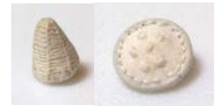
High top button