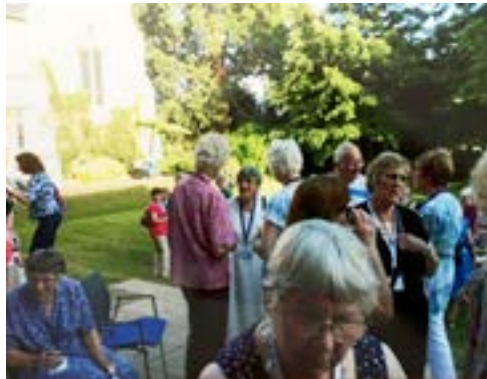
Delegates from many U3As

the campus was good and we had ample time to socialise – it all made for a very enjoyable atmosphere and loads of laughter: