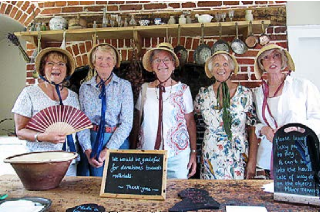
Ladies in bonnets at Chawton