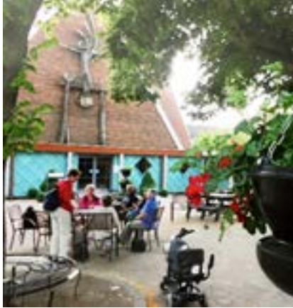
The venue not far from the theatre